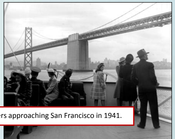
Photo of passengers approaching San Francisco in 1941.