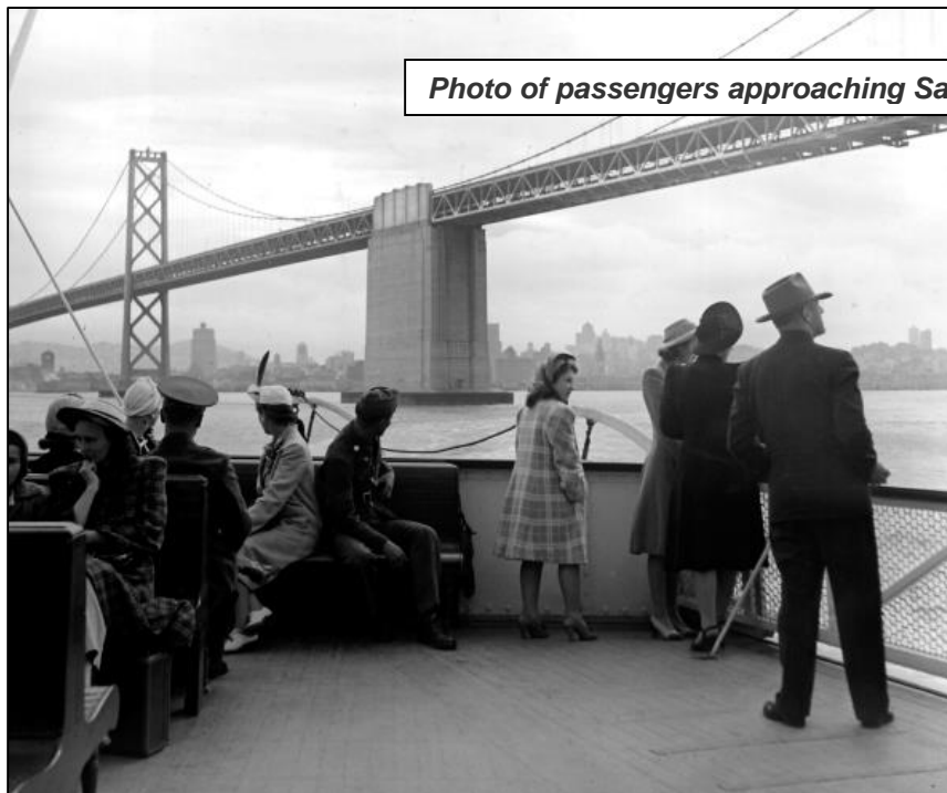
Photo of passengers approaching San Francisco in 1941.

Mom remained sick for a few days but the worst was over when the storm passed and she spent her days (two weeks) either writing letters which she knew she wouldn't have time for once the ship arrived in San Francisco, or on a deck chair out in the fresh sea air, making hot pads on a small loom. She made white ones with pink trim, white ones with blue trim, white ones with multicolored sprinkles. She never made one before that trip, nor did she ever pick up that loom again after the trip.